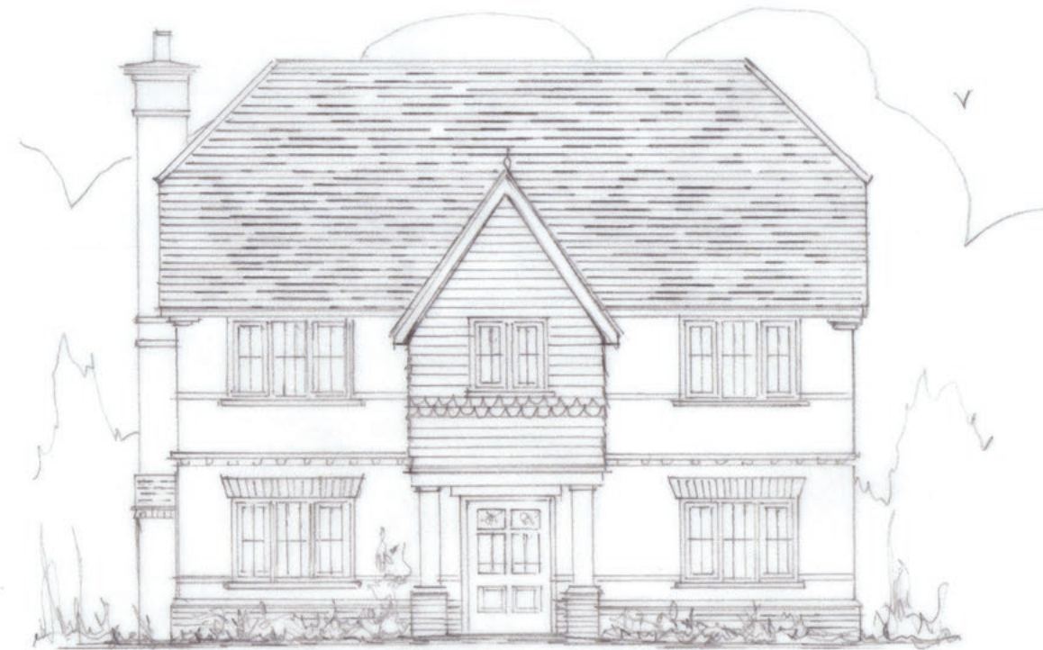
Type A Front Elevation